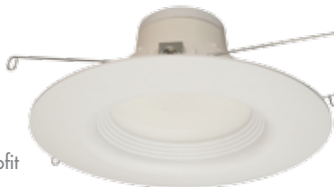
5/6" Dimmable HiCRI Recessed Retrofit