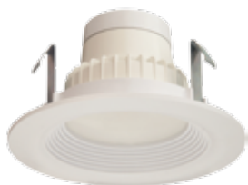
4" Dimmable HiCRI Recessed Retrofit