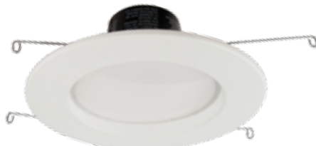
5/6" Dimmable Recessed Retrofit