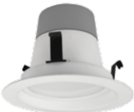
4" Dimmable Recessed Retrofit